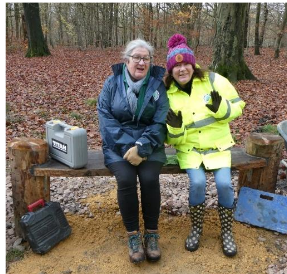
Low Wood Main pathway seating

The location of the six seating areas was planned to provide seating at regular distances as shown in red on the map. Seating location, comfort, and stability were assessed and agreed as acceptable by Maxine and Karen our quality control team.